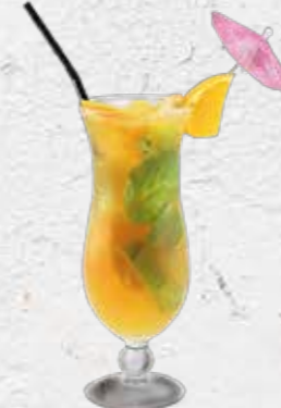
PIMM NO.1.....$16 (JUG $33)

A cosmopolitan is cocktail made with premium Vodka, Cointreau, cranberry juice and freshly squeeze lime juice.