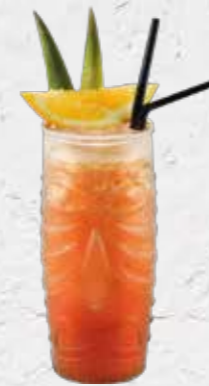
MAI TAI.....$16 (JUG $33)

Light Rum, pineapple juice and coconut cream