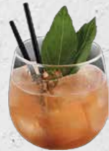
HO RA PA.....$17

This cocktail is mixed from almond flavoured liqueur mixed with fresh lemon juice, dash of sugar syrup, egg white and shaken until the perfect consistency. Top with red wine