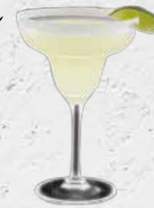
MARGARITA OR PASSION FRUIT.....$15

Kinn mojito is a cocktail consisting of refreshing citrus and mint flavors are intended to complement the potent kick of Rum.