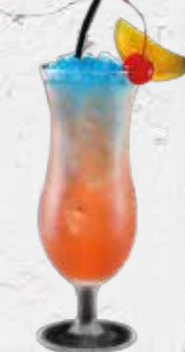
SEX ON THE BEACH.....$16

Tequila mixed with orange flavoured liqueur and lime juice often served with a salt rim.