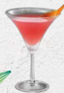
COSMOPOLITAN OR RASPBERRY.....$15

Brazil's national cocktail made with cachaça, brown sugar and lime.