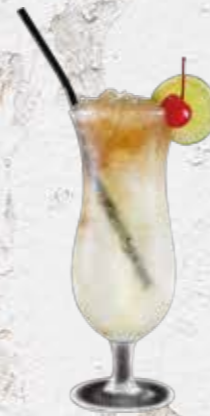
LONG ISLAND ICED TEA.....$17 (JUG $35)

The mai tai is a Rum based cocktail mixed with orange liqueur, tropical fruits juice and lime juice.