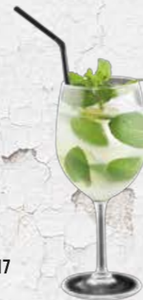
MOJITO.....$15 (JUG $31)

As the name suggests this cocktail originated in the city of Babylon in Long Island. A summer drink with a perfect mix of Vodka, Gin, Rum, Tequila, Cointreau with sour mix and a dash of coke